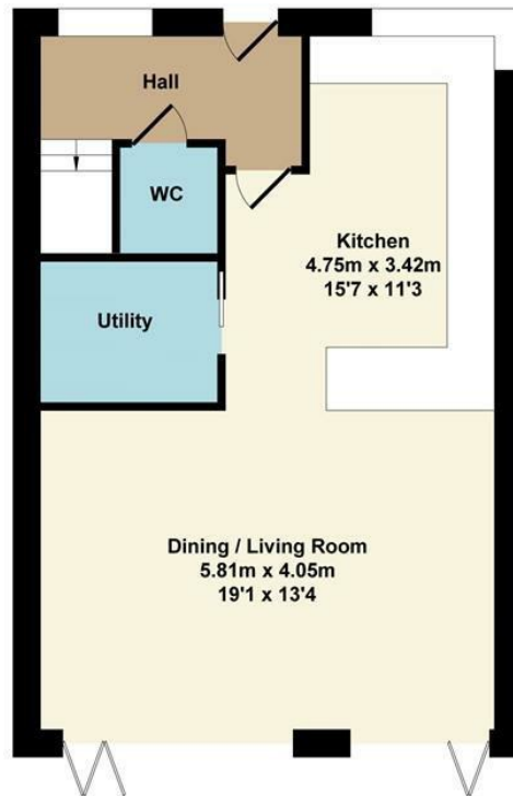
Ground Floor Approx. Floor Area 50.8 Sq.M. (547 Sq.Ft.)

Whilst every attempt has been made to ensure the accuracy of the floor plan contained here, measurements of doors, windows, rooms and any other items are approximate and no responsibility is taken for any error, omission, or mis-statement. This plan is for illustrative purposes only and should be used as such by any prospective purchaser. The services, systems and appliances shown have not been tested and no guarantee as to their operability or efficiency can be given.